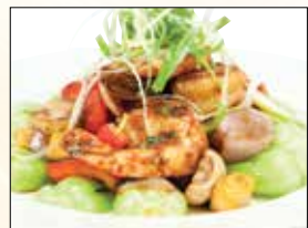
Garlic Prawns $19.95