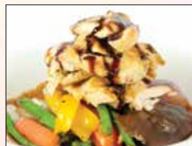
Chicken Teriyaki $14.95