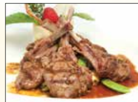
Rack of Lamb $26.95