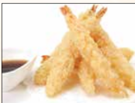
Shrimp Tempura $14.95