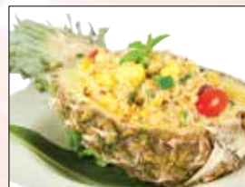
Asian Pineapple Fried Rice $8.75