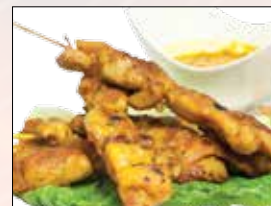
Chicken Satay $6.25